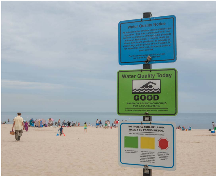
Beach Status and Water Quality Alert Signs at Indiana Dunes State Park in Chesterton, IN.

In 2021, the IDEM with support from the GLRI, developed IDEM BeachAlert, a modern and mobile-friendly beach monitoring and notification system. Such a system, which meets requirements set by the Beaches Environmental Assessment and Coastal Health (BEACH) Act , is critical to collecting and disseminating information on beach closings and advisories to members of the public, researchers, and others.