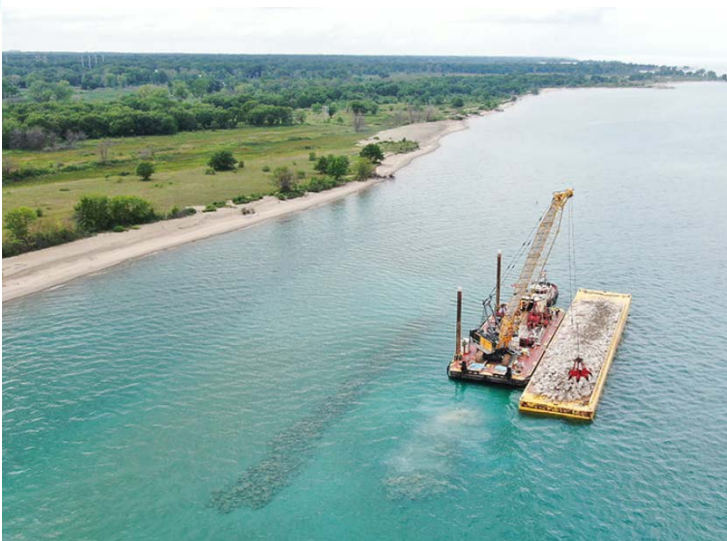
USACE building offshore, submerged ridge at Illinois Beach State Park.

Resources (IL DNR), supports important wetland, dune, and savanna habitats. These critical habitats are home to many important endemic and/or endangered plant and animal species, including four federal and 60 state listed species.