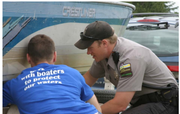
Watercraft inspector and conservation officer working together to inspect a boat for aquatic invasive species.

The purpose of the Network is to provide comprehensive and uniform coverage of AIS programming outlined in WDNR's AIS management plan. This plan focuses on expanding the reach of programs like Clean Boats Clean Waters, Water Action Volunteers, AIS Snapshot Day, and the Citizen Lake Monitoring Network. In large part due to the LMPNs efforts monitoring and outreach efforts, Wisconsin completed over 47,000 watercraft inspections within the Lake Michigan basin in 2021.