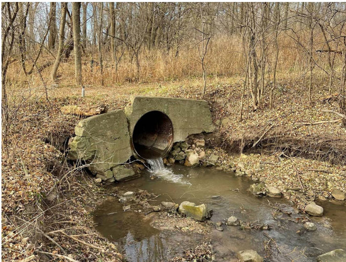
Undersized culvert on Willow Creek to be removed in conjunction with stream bed restoration to improve fish passage of Lake Michigan trout and salmon.

Engineering and design began in spring 2021 for a fish passage project in Willow Creek, a cold-water tributary to the Sheboygan River in Wisconsin. Two culverts will be removed in 2022, allowing passage of aquatic organisms, including Brook Trout, which naturally reproduce in the stream. The project is located within Willow Creek Preserve, a 143-acre nature preserve owned by Glacial Lakes Conservancy (GLC). Acquisition of the preserve, the fish passage project, and other restoration work on the property are funded by the Sheboygan River and Harbor Natural Resources Damages Assessment and Restoration settlement. The Natural Resource Trustees for the river (WDNR, NOAA, and USFWS) are supporting GLC with technical support as they finalize plans, draft a request for proposals, select a contractor to implement the project, and coordinate monitoring of project outcomes. Removal of the culverts will allow fish to reach more spawning habitat and improve in-stream habitat.