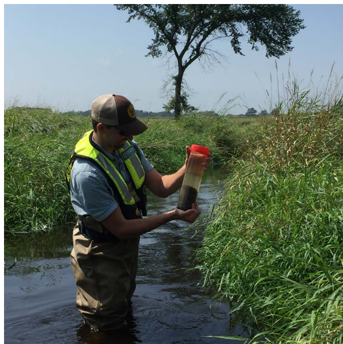
Biologist collects streambed sediment sample from the Upper Fox River, as part of a study to measure sediment nutrient processes that can improve downstream water quality.

Water quality also can be improved through natural processes occurring in the water and streambed sediments in the river system. With support from the GLRI, researchers from the U.S. Geological Survey (USGS) measured the nutrient retention and removal potential in streambed sediment of the Fox River Watershed, as well as the water column nutrient processing at the Fox River mouth from 2016-2018. The results of this study show that microbial activity in the streambed sediments can remove nitrogen from the water, especially in areas with more vegetation along the sides of the river. The streambed sediments also store phosphorus and convert it to a form that algae cannot use as easily; therefore, the phosphorus is less likely to fuel cyanobacteria blooms even if it is later released back into the water. Protecting and restoring riparian vegetation and stream habitats could help reduce nutrient pollution entering Green Bay.