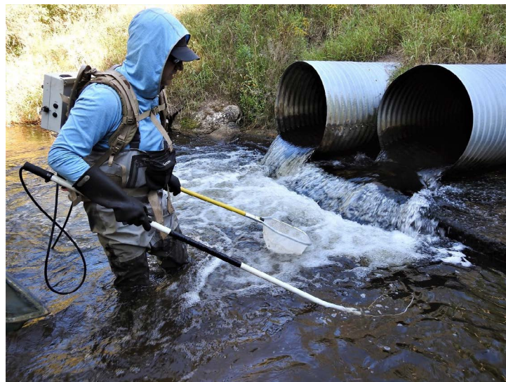
Baseline fish sampling prior to replacing perched culverts in Little Cedar Creek at Sweeter Road to restore fish passage for native Brook Trout.

Trout, Sculpin, and Brown Trout. With GLRI funding, the National Oceanic and Atmospheric Administration (NOAA) supported the planning phase of this project. In 2022, WMSRDC and partners will use GLRI funding to replace two perched, plugged, undersized culverts with adequately sized, clear span culverts and bridges, and create in-stream fish habitat enhancements to improve fish habitat and facilitate passage near the new structures.