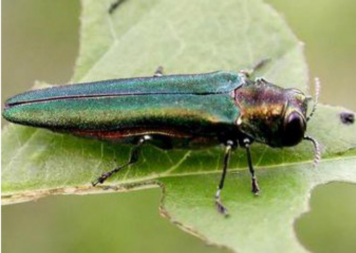
The Emerald Ash Borer is a destructive wood-boring pest of ash trees.

vigilant to monitor the remaining areas not yet impacted by EAB.