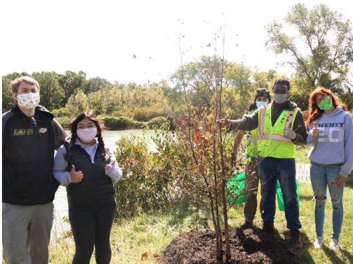
Calumet tree crew planting at Robinson Lake in Lake County, Indiana.

trees in communities in Northwest Indiana, while providing these communities with educational materials on the environmental, economic and health benefits of trees. Get a firsthand look at what the collective effort brings to Northwest Indiana in this CommuniTree Video .