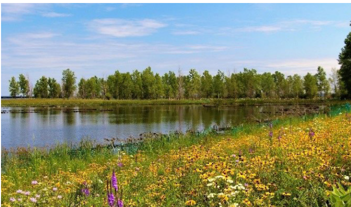
Top: Menekaunee Harbor before restoration, dominated by invasive Phragmites. Bottom: Menekaunee Harbor after restoration, with thriving native plant communities.

Menekaunee Harbor is now cleaner, deeper and able to accommodate recreational and commercial fishing boats. The change from a highly contaminated three-mile section of river into one that is a sportfishing destination with successfully reproducing fish and wildlife populations is a result of substantial long-term commitments from many partners.