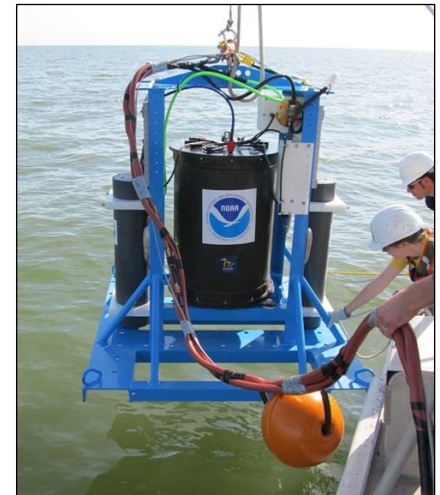
A test deployment of the ESPniagara in June 2016.

Toledo Water intake, allowing detection of concentrations of toxins as a drinking water early warning system. This toxicity data, coupled with NOAA's existing suite of Lake Erie HAB products (i.e. weekly Lake Erie HAB bulletin and the Experimental HAB Tracker), can provide water managers with more precise bloom location, projected direction, intensity, and toxicity.