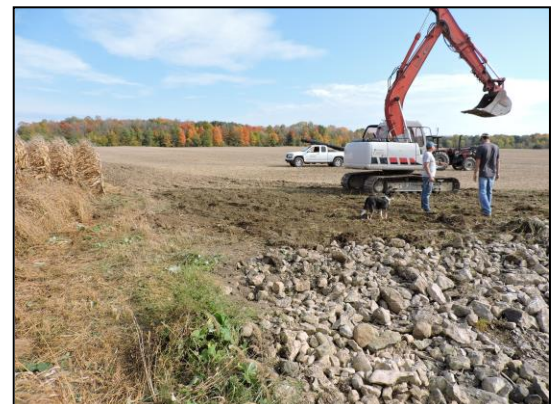
Conservation authority working with rural landowners to install BMPs to prevent soil and nutrient runoff.

The Upper Thames River and Lower Thames Valley Conservation Authorities (CAs) are implementing initiatives to reduce nutrient loading to local water courses, and ultimately to Lake Erie, in support of binational