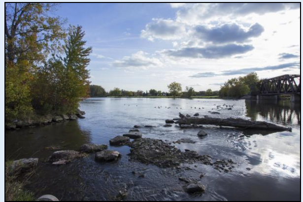
Rock arch ramp in the River Raisin providing fish passage throughout the River Raisin AOC and beyond.

The sediment clean up at the River Raisin AOC on the southeast portion of Michigan's Lower Peninsula in Monroe County is complete. Since 2010, U.S. EPA has provided more than $27 million in GLRI funding to accelerate implementation of actions to restore the AOC. The GLRI funds have leveraged an additional $18 million in state and private funding for AOC work. The federal, state, local, and private partnership projects have remediated over 150,000 cubic yards of PCB-contaminated sediment, restored over 300 acres (1.2 km 2 ) of aquatic habitat, and opened up an additional 23 miles (37 km) of the River Raisin to fish migration and spawning.