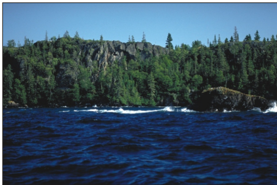
Isle Royale National Park, Lake Superior.